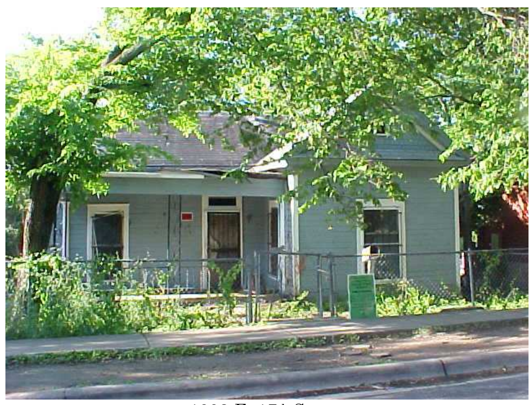
1903 E. 17<sup>th</sup> Street ca. 1913