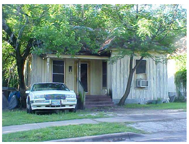
1911 E. 17<sup>th</sup> Street ca. 1912