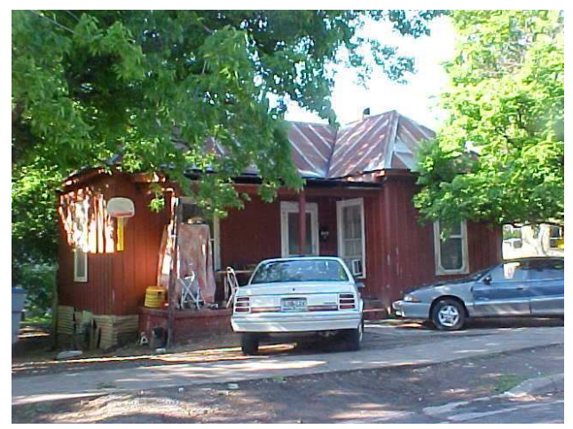
1901 E. 17<sup>th</sup> Street ca. 1915