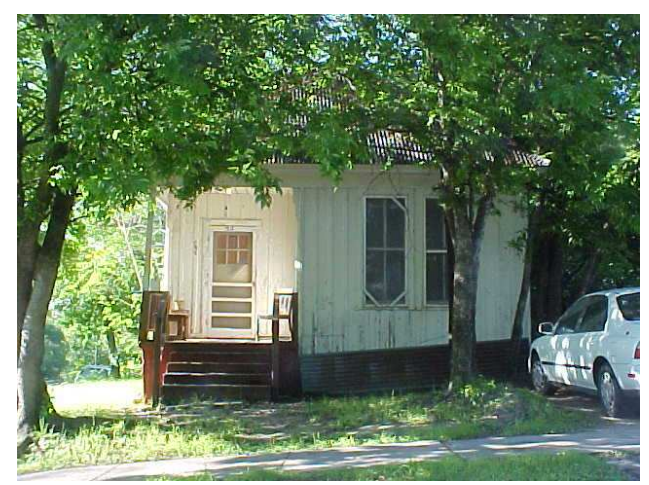
1913 E. 17<sup>th</sup> Street ca. 1913