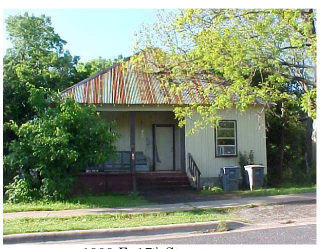
1909 E. 17<sup>th</sup> Street ca. 1915