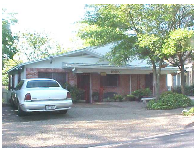
1905 E. 17<sup>th</sup> Street ca. 1939