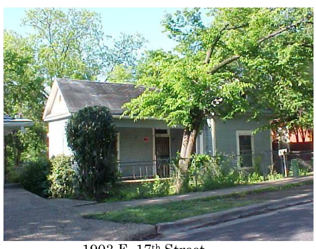
1903 E. 17<sup>th</sup> Street ca. 1913