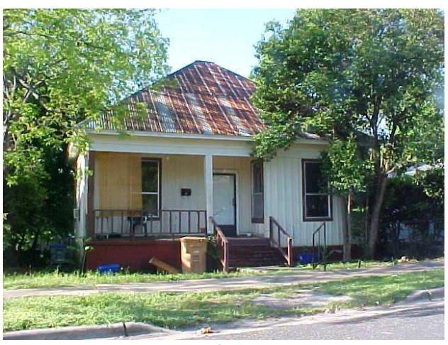
1907 E. 17<sup>th</sup> Street ca. 1915